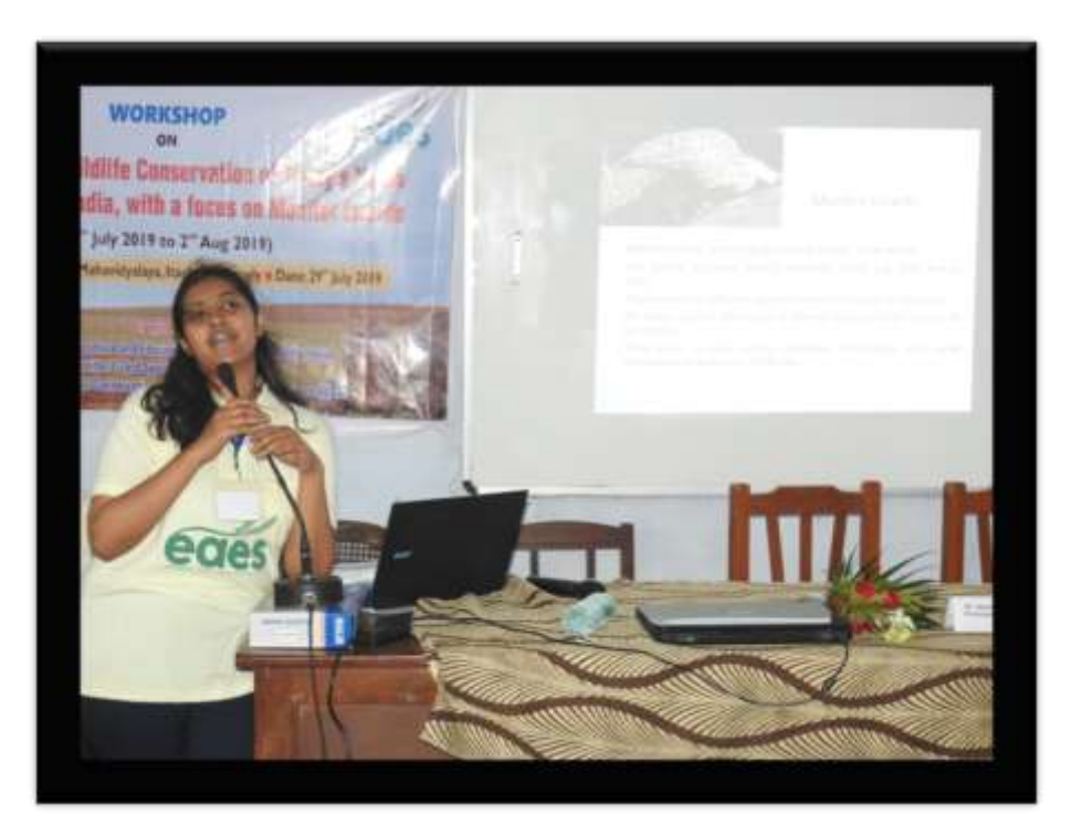
Speech of Resource person