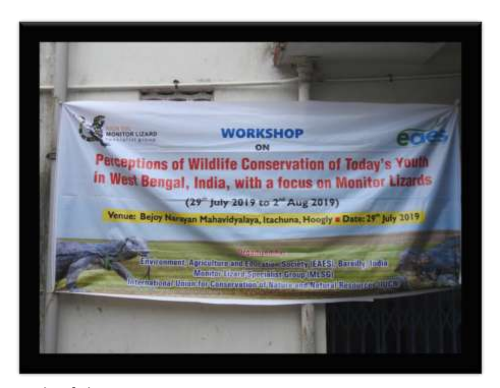
Details of the Seminar