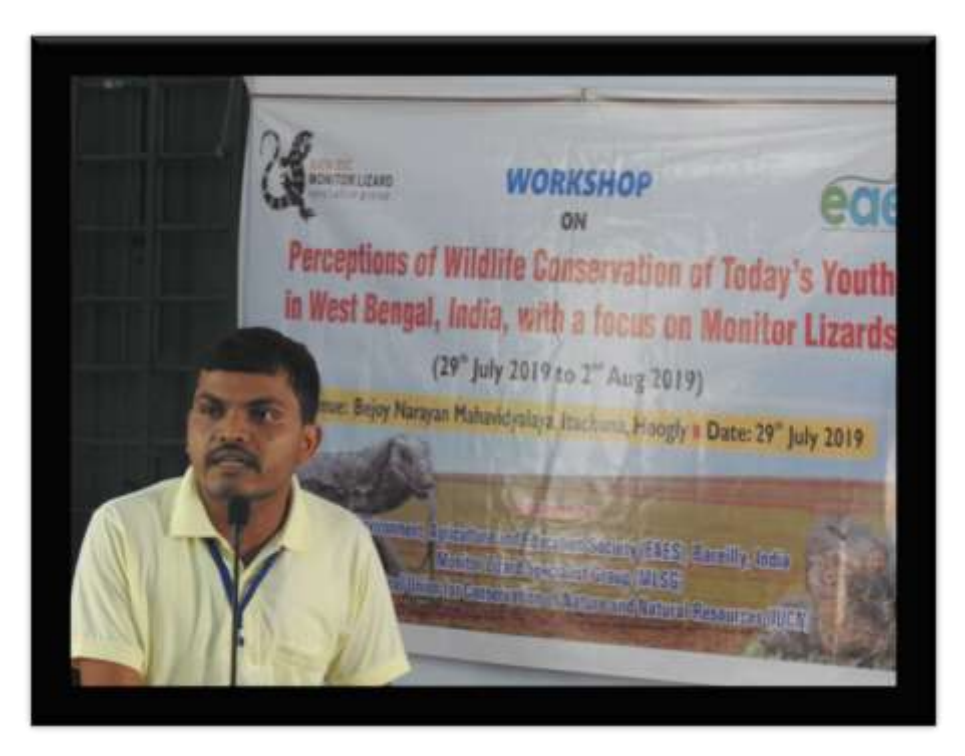
Speech of Resource person